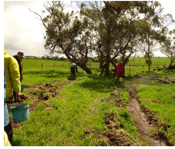
Landcare members assisting the Dunlops to direct seed their Middle Tarwin property.

Once the funding was received (and access to the site) we were able to employ the Bass Coast Landcare Works team to first spray various weeds on site and then cut down the large Sweet Pittosperum on the steep bank. The team had to abseil down the bank which was the only option to access these large weeds. They returned in mid June to assist to replant the steep area. Approximately half of the 4000 plants for this project were planted in a community planting day held in June which attracted both Landcare members and rail trail users alike. These plants had been grown from locally collected seed. A new sign will be erected onsite to explain the project and site